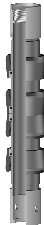
4 Cup Version